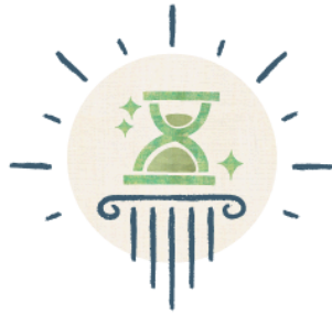
EXPLICIT INSTRUCTION, INTERVENTIONS, & EXTENSIONS