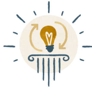
ONGOING PROFESSIONAL GROWTH